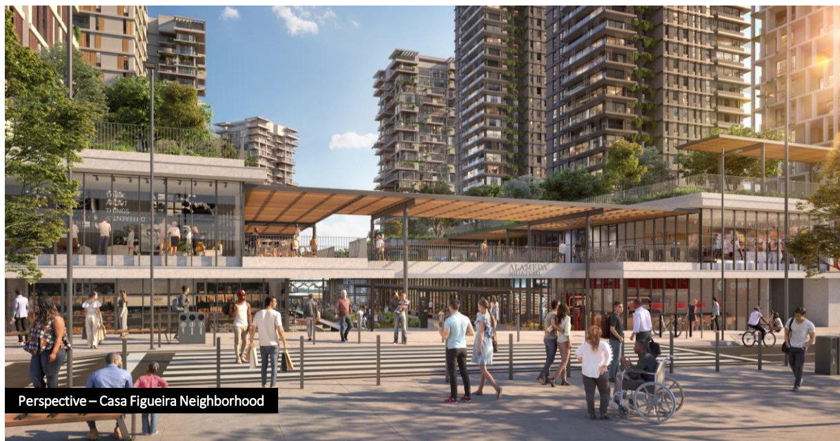
Perspective – Casa Figueira Neighborhood